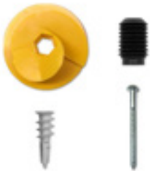
Rotofast™ Snap-on Anchor System