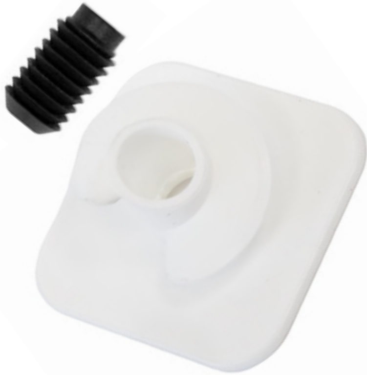
Rotofast™ Polyester Snap-on Anchor