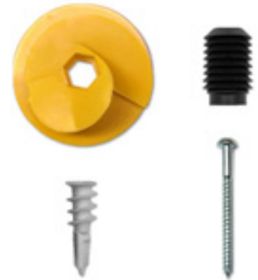
Rotofast™ Snap-on Anchor System