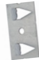
Angled Impaling Clips